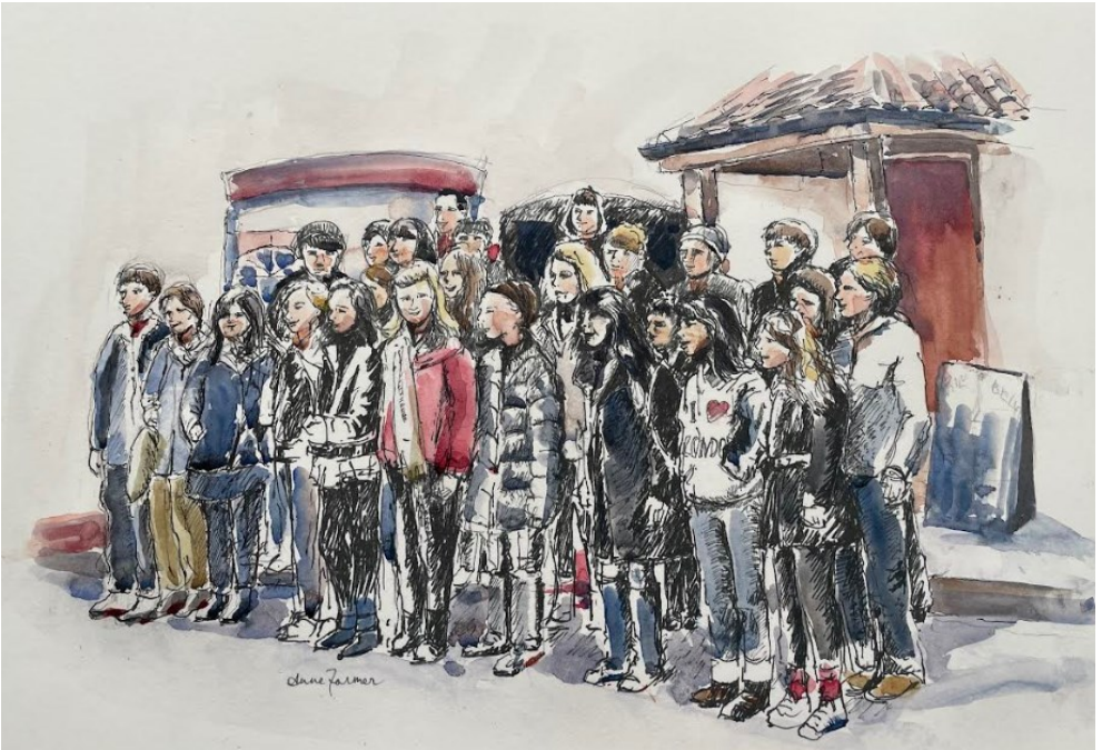
Visit of American Choir 2011 – Drawing by Anne Farmer

This edition of the MOMSS magazine has been sponsored anonymously so that it can continue to be delivered free of charge to each home in our villages. We are very grateful to our sponsor.