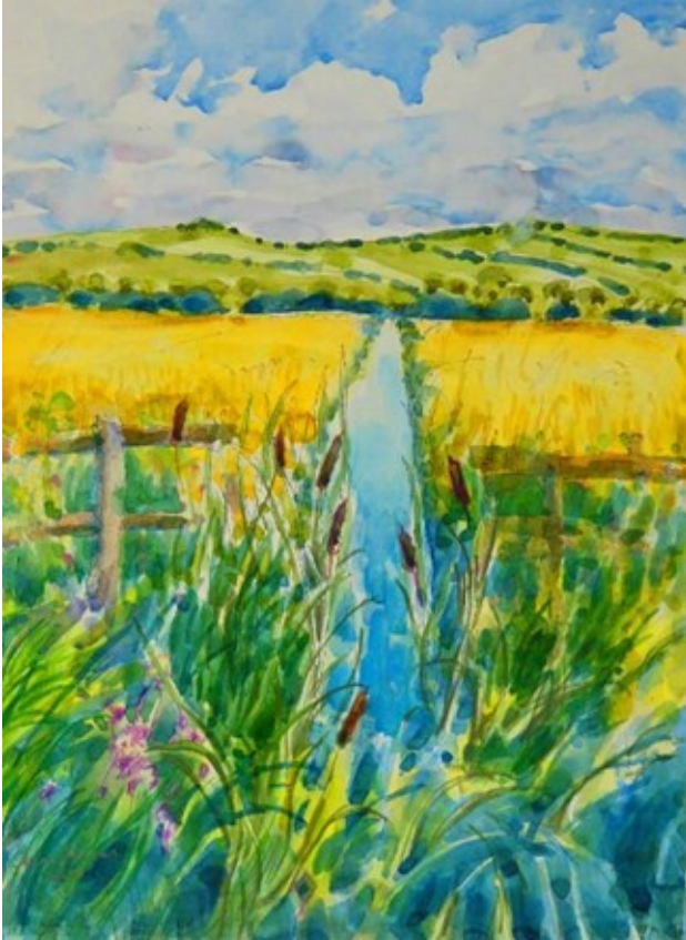
Sunlit Rhyne Drawing by Anne Farmer