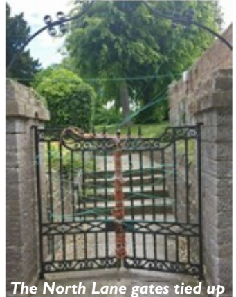
The North Lane gates tied up