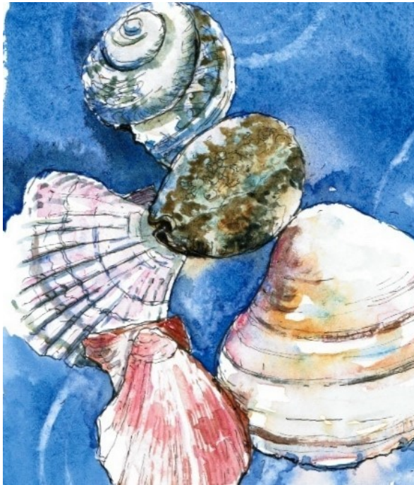
Holiday souvenirs