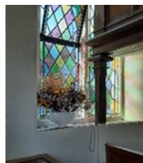
an interior view