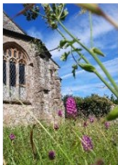
Orchids in the churchyard