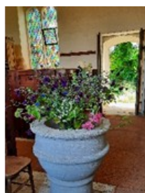
Font, with flowers