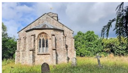
Sutton Mallet Church