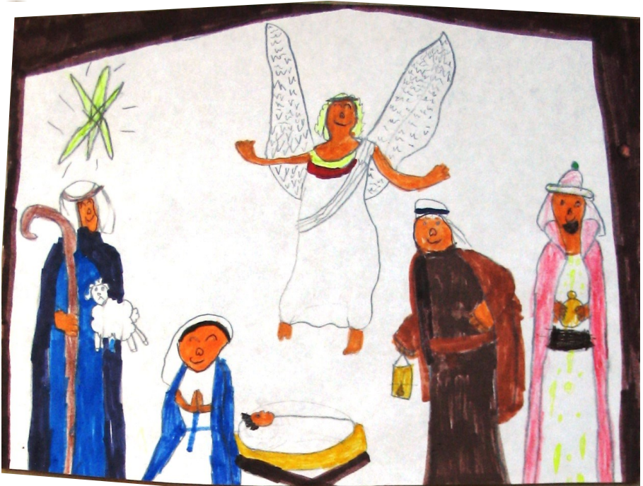
The First Christmas - drawing by Ellah Hale aged 7

Thank you to the children and young people of our villages for all their drawings, others of which appear throughout the magazine.